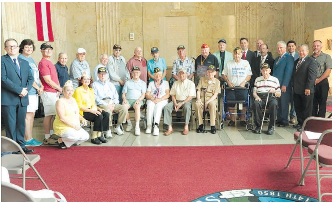
Veterans, Gold Star Widow, and Officials standing together.