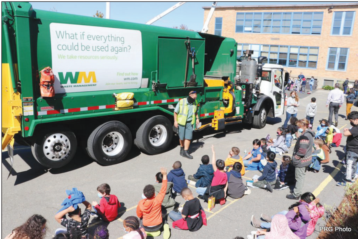
Waste Management Driver explains how this 12 tire vehicle operates as he answers questions from the students.