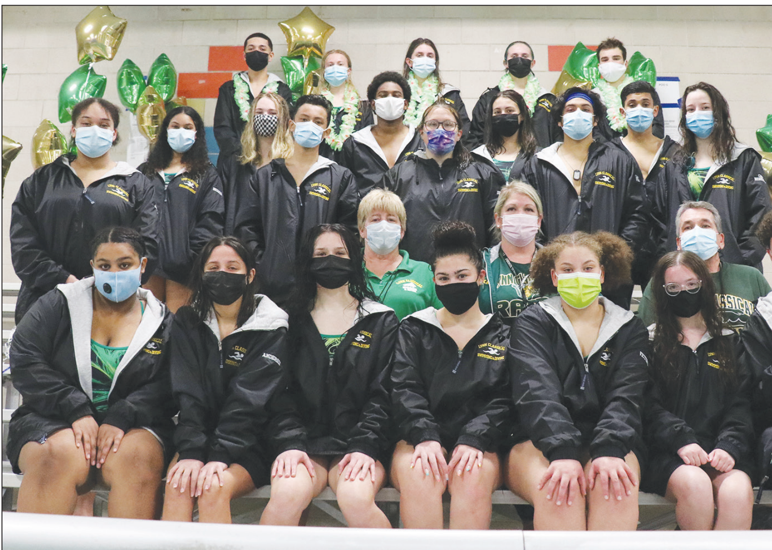
The 2021 Lynn Classical High School Rams Varsity Swim Team and coaching staff.