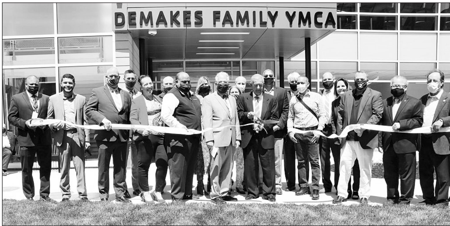
Official Ribbon Cutting Ceremony with State and Local Delegation, YMCA Officials, and Greater Lynn Chamber of Commerce members.

This state-of-the-art 70,000 square-foot building will offer more fitness programs, computer technology, and healthy cooking classes for the membership and the community.