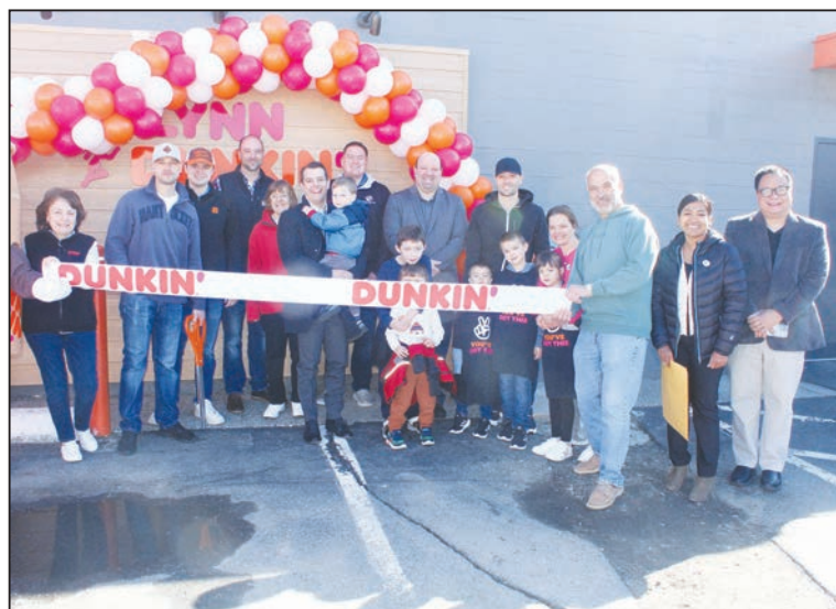
The Mello family cuts the ribbon for its newly remodeled Next Gen restaurant, Dunkin', located on Lewis Street.