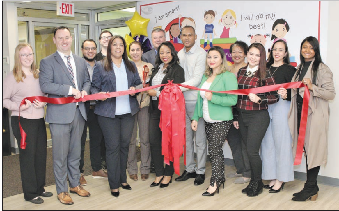
Official Grand Opening for Imagination Station Learning Center in Peabody.