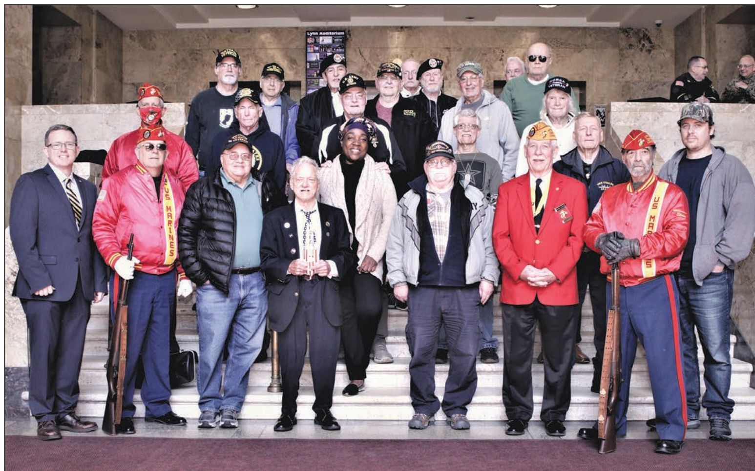
Vietnam Veterans with other Veterans who served the United States during the Korean Conflict and the Middle East.

For Advertising Rates, Please Call 781-485-0588