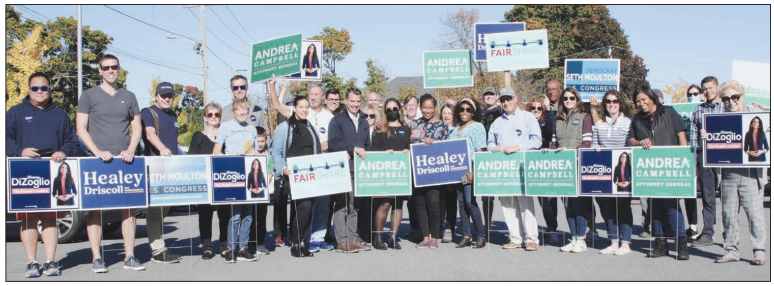
Supporters for Massachusetts' candidates for state office.