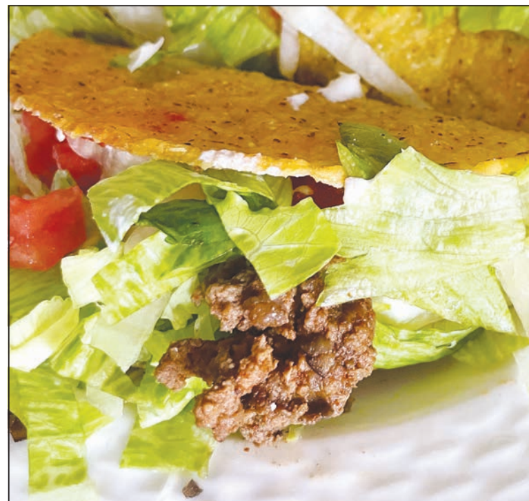
Our love of tacos brought Iceberg Lettuce back into our kitchen.

If she's not using the whole head but shredding off some for our favorite Vietnamese noodle salad (Bun Thit Nuong), she'll select the best outer leaves she removed and trim off brown spots. She wraps those leaves over the cut end before she returns the head to a clean bag for storage. We find it protects the