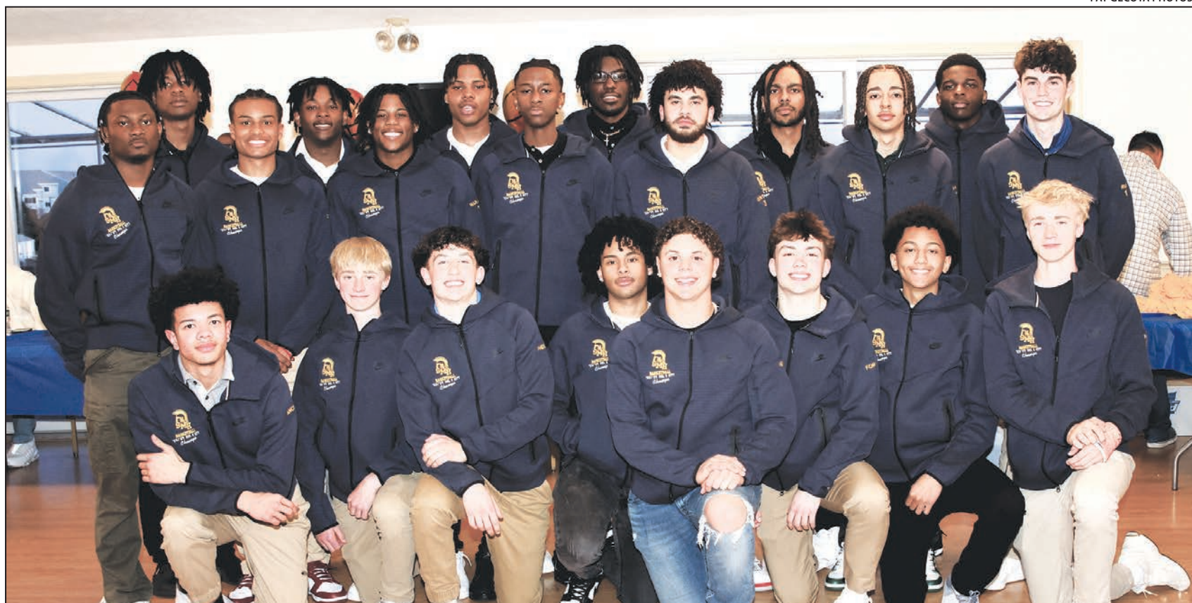
St. Mary's Boys Varsity Team received 2023-2024 Catholic Conference League and City Champions Spartan pullovers.

The St. Mary's High School boys varsity basketball team captured two championship titles during the 2023-2024 season. The team won the Catholic Central League and the City of Lynn Championships. Friends, coaches, and families celebrated the team's championship run with a banquet and award's presentation.