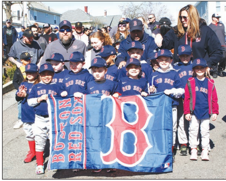
Minor League Red Sox players excited on Open Day.