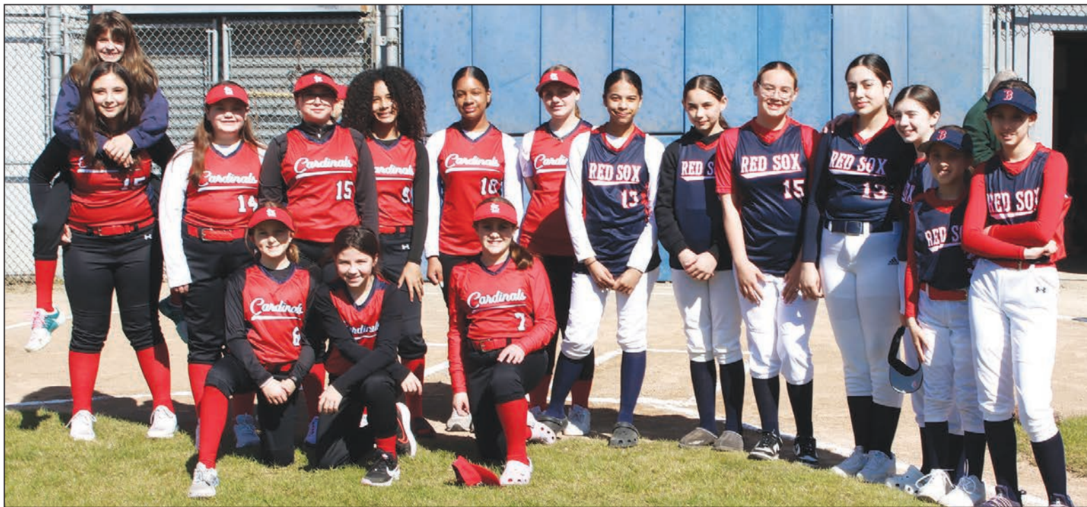
Major League softball players are ready for the 2024 season.