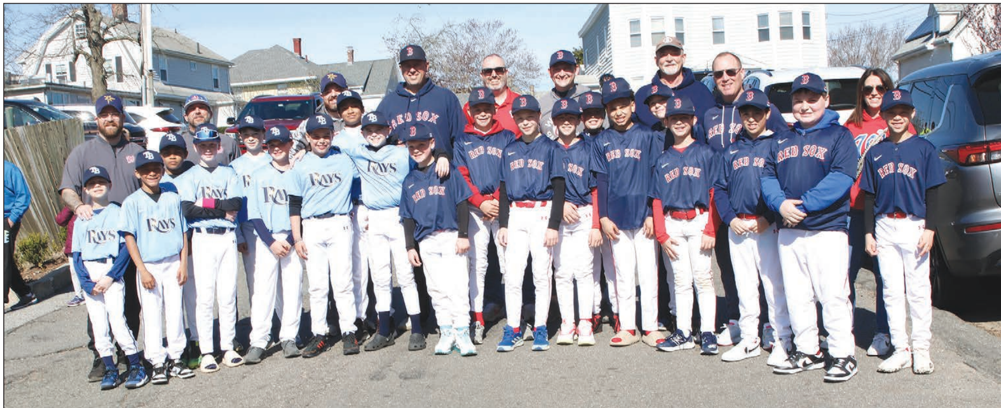
Major Rays and Red Sox players with coaches ready to play ball.