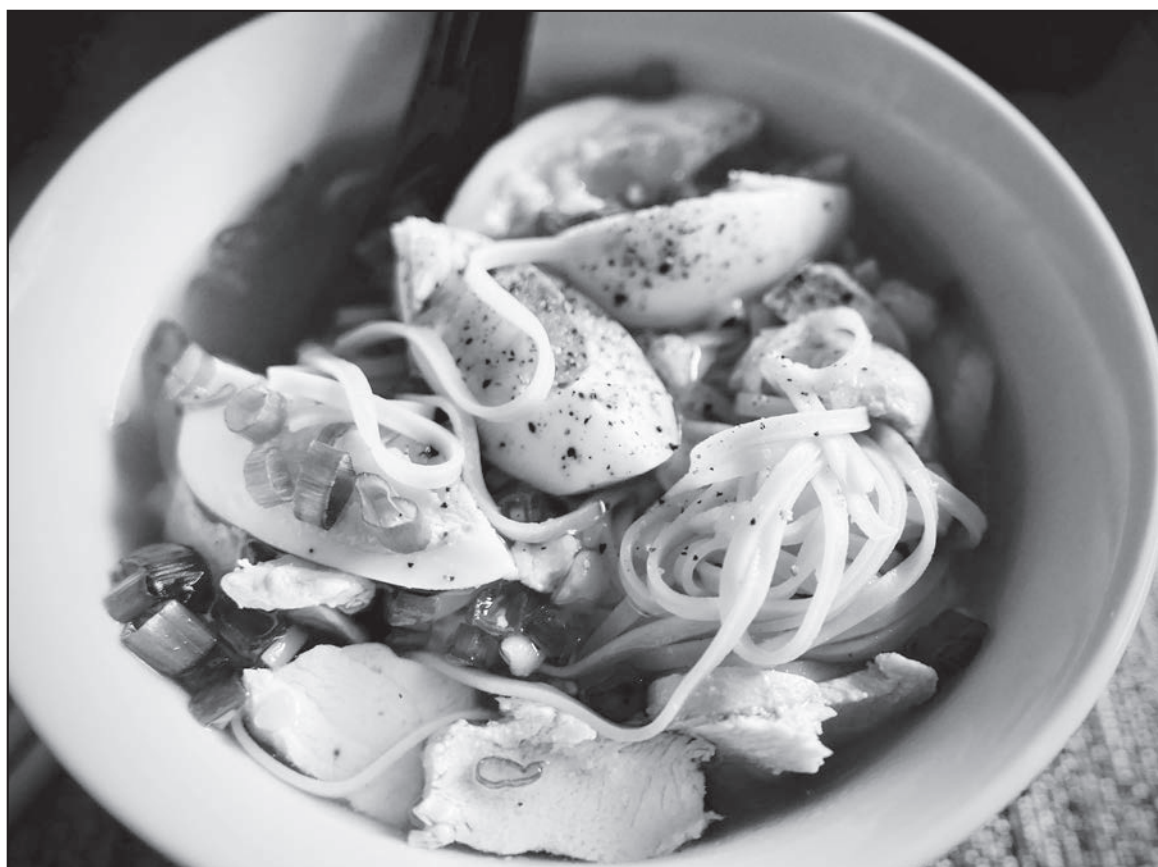
Here's our version of a quick supper created with stock from our freezer, leftovers, and a pile of delicious noodles for slurping.

Read the package instructions and see if they make sense, but remember that learning how these noodles are prepared in their countries of origin may be more helpful. Some are best soaked, others boiled, some need a cold rinse after cooking, and others should be tossed with oil