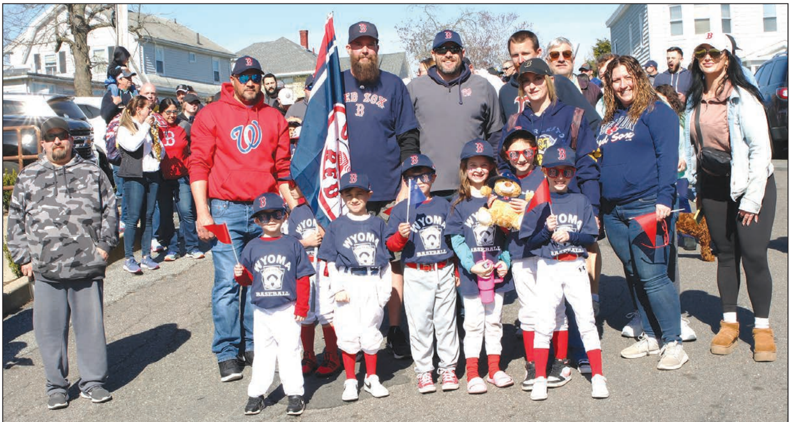
Wyoma Little League Tee-Ball Red Sox players with their parents.