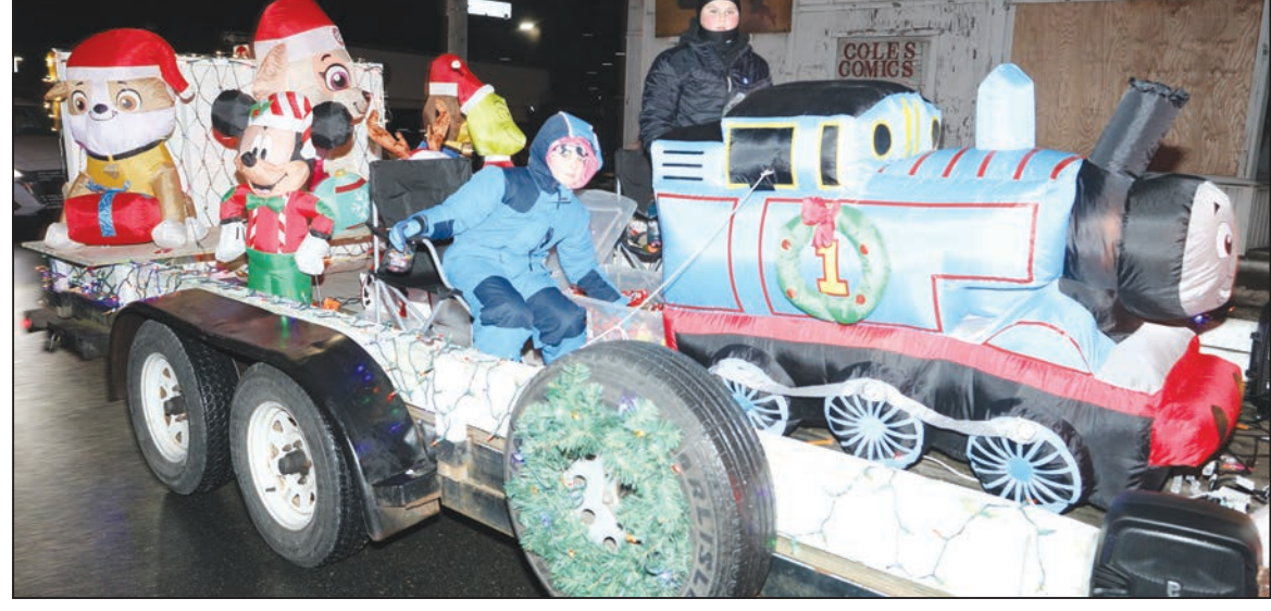
A train load of Disney characters made its way through Lynn last Tuesday evening.