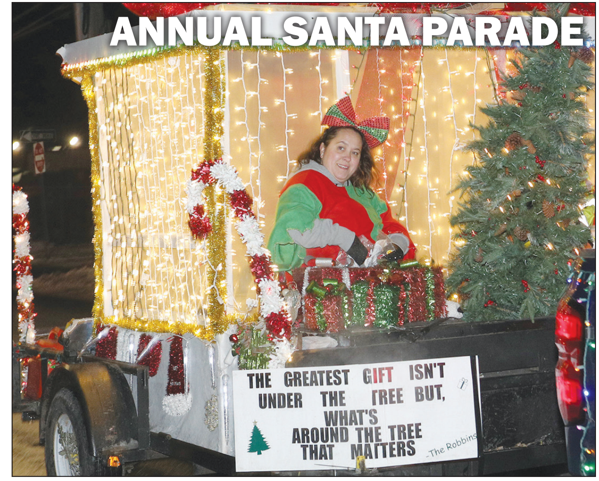
Dozens of floats made their way across Lynn bringing Christmas cheer along the way during the annual City of Lynn Santa Parade on Christmas Eve. See more photos on Pages and 7.