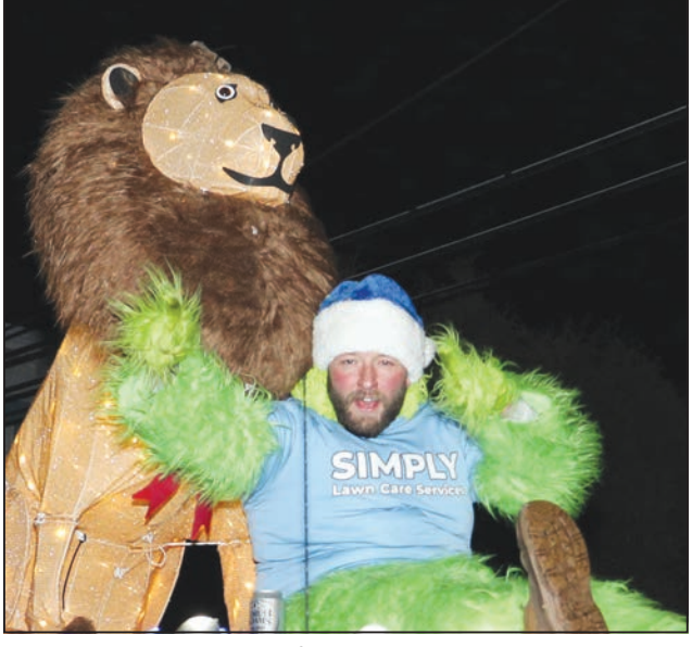
The Lion King was part of the parade.