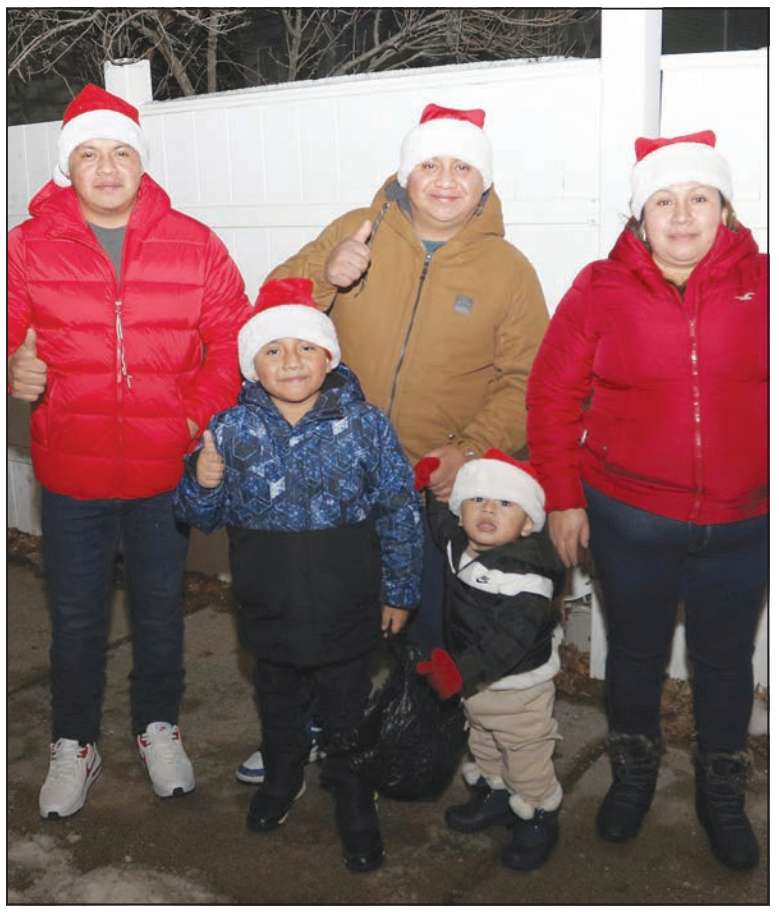
Residents turned out with Santa hats to welcome Sant to Lynn.