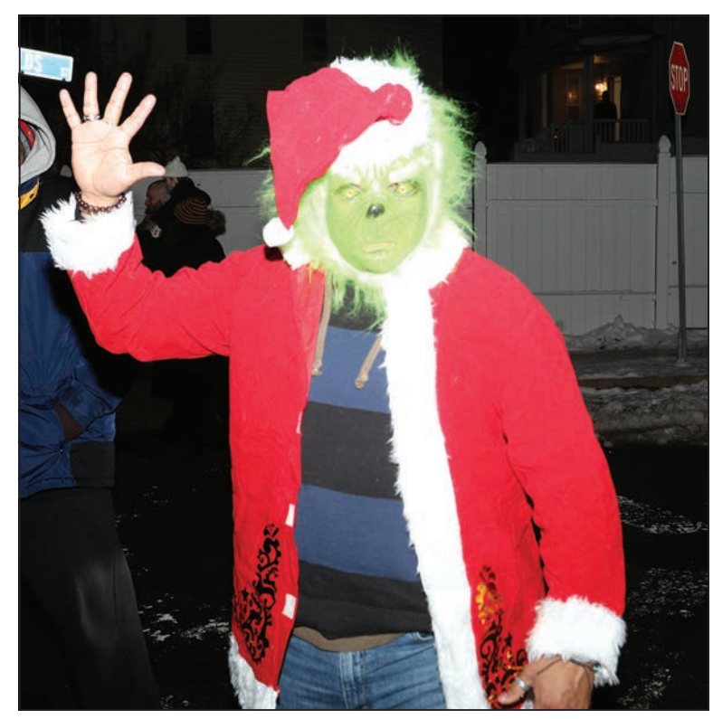
Even the Grinch shows up for the Annual Lynn Santa Parade.