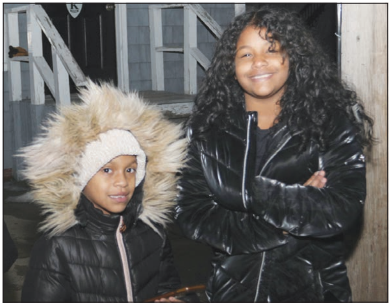
The Santa Parade brings lots of smiles on Christmas Eve in Lynn.

The City of Lynn's annual Santa Parade is quite the spectacle to behold, Santa and Mrs. Claus along with hundreds of volunteers glide through the streets of Lynn on Christmas Eve, bringing joy and treats to all the good boys and girls that turn out to greet Santa along his route.