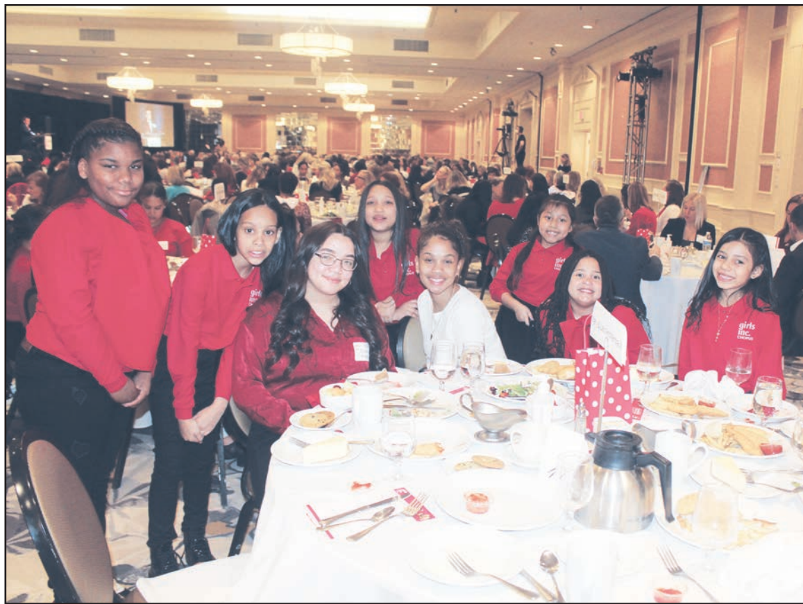
Member of Girls Inc., Lynn, are pictured at the luncheon held April 7 at the DoubleTree by Hilton Hotel, Danvers. See Pages 10 and 11 for more photos.

The students are invited to a luncheon meeting at the Olde Tyme Italian Cuisine and are individually presented with an award certificate as well as a gift card to Barnes & Noble bookstore. The Club is grateful to River Works Credit Union for its support of the program.